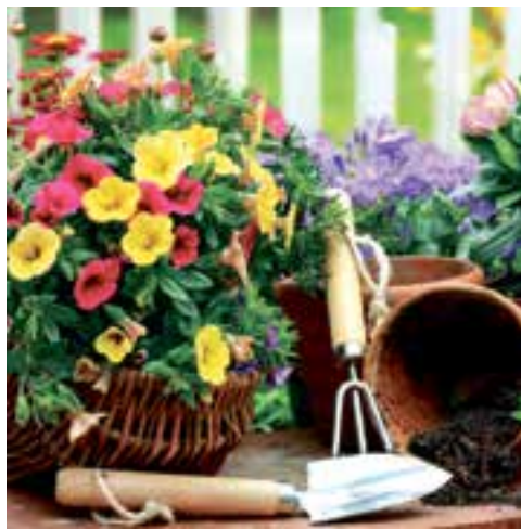
Article supported by: