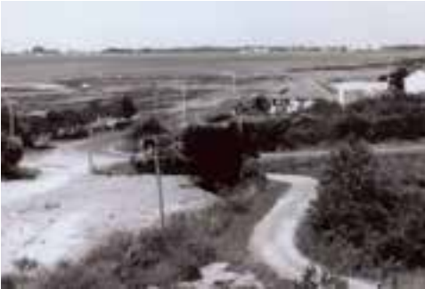
Otumoetai / Beach Road Corner